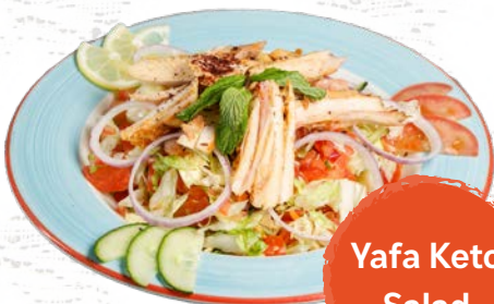
Yafa Keto Salad